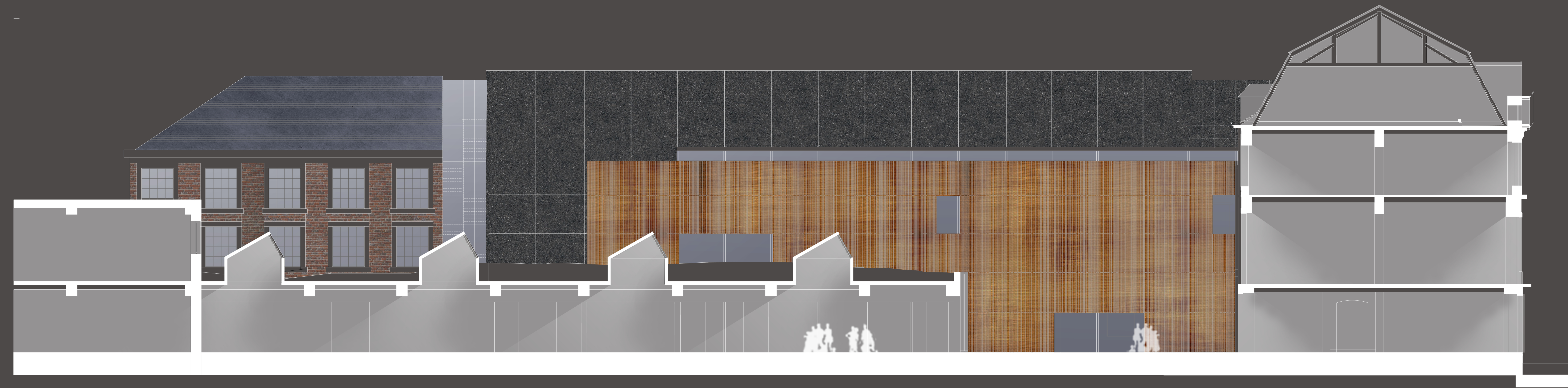
COUPE LONGITUDINALE / éch. 1-100e