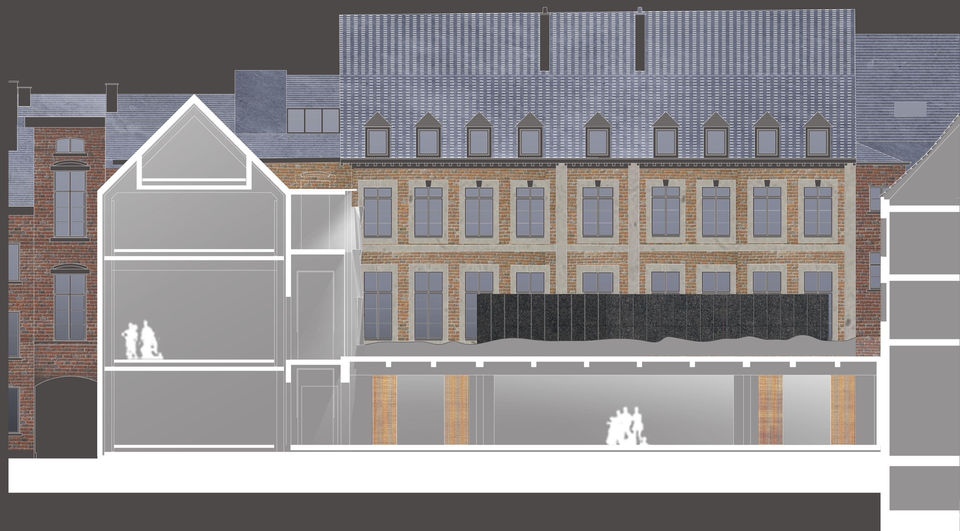
COUPE TRANSVERSALE / éch. 1-100e