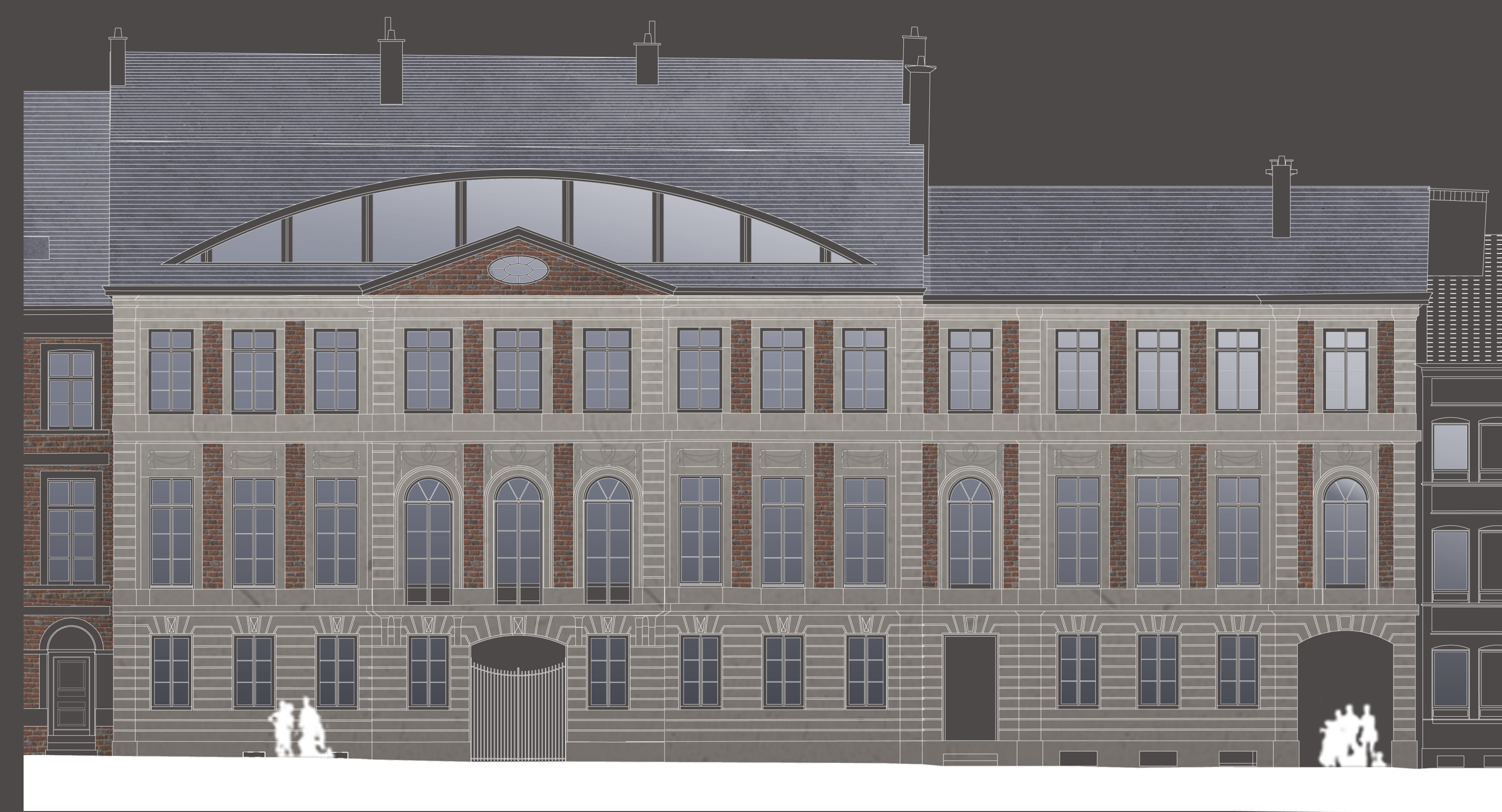
ELEVATION PLACE DE SOMMEVILLE / éch. 1-100e