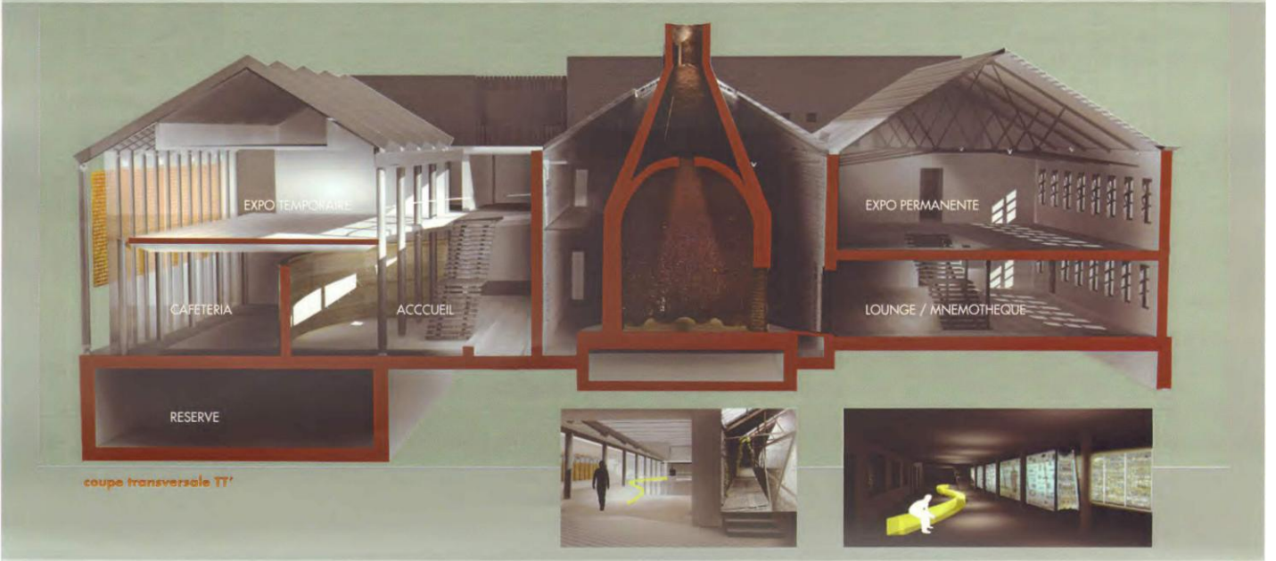
coupe transversale TT'