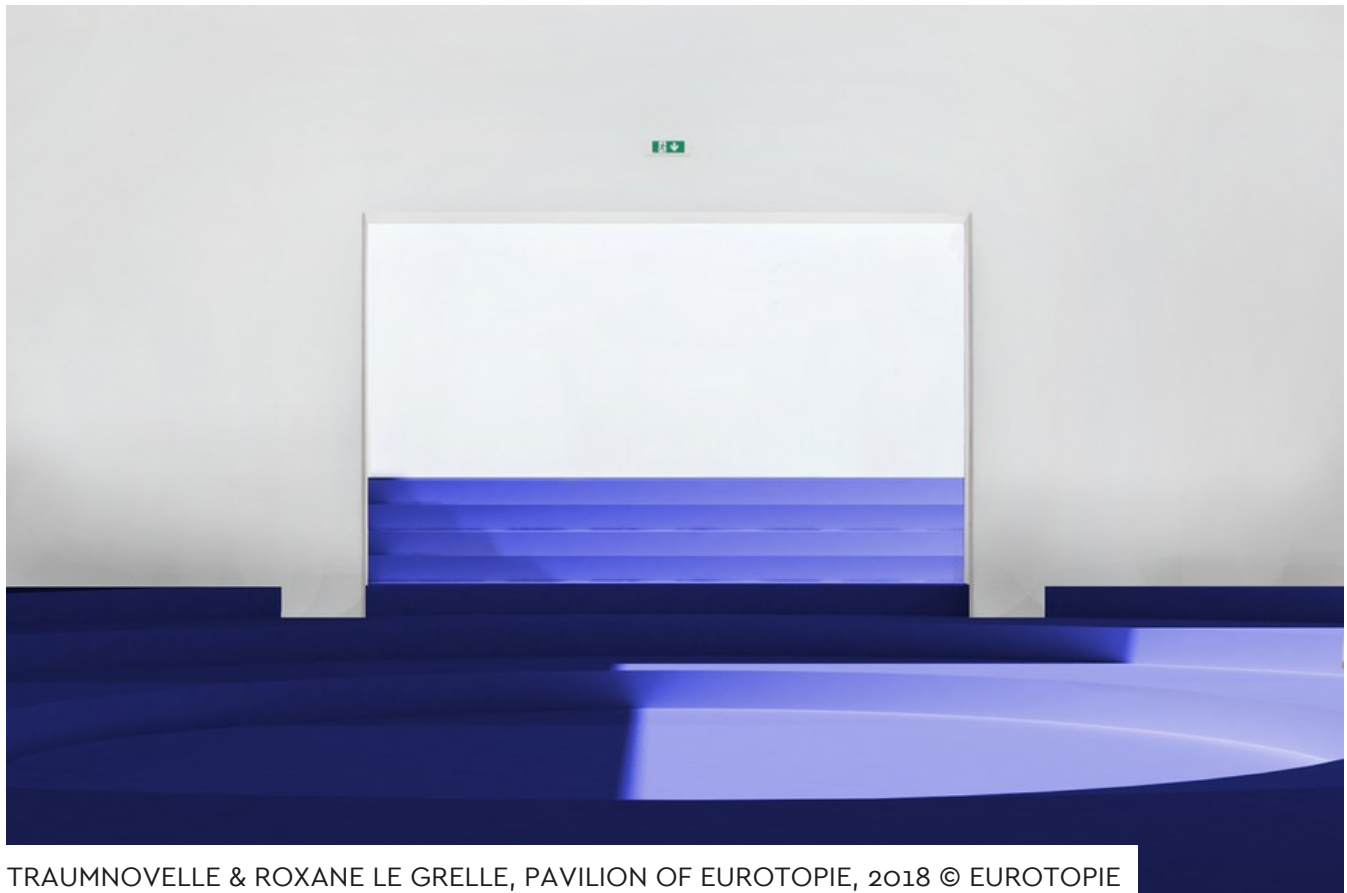
TRAUMNOVELLE & ROXANE LE GRELLE, PAVILION OF EUROTOPIE, 2018

It boasts high ceilings and beautiful natural light as well as a prime location along the major axis of the Giardini. At each edition of the Architecture Biennale, creatives from Flanders and Wallonia are alternately selected to curate the Pavilion. For this edition, Fédération Wallonie-Bruxelles (FWB) and Wallonie-Bruxelles International (WBI) launched an open call and selected Eurotopie to represent Belgium