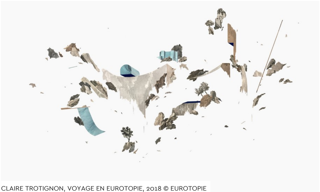
CLAIRE TROTIGNON, VOYAGE EN EUROTOPIE, 2018 © EUROTOPIE