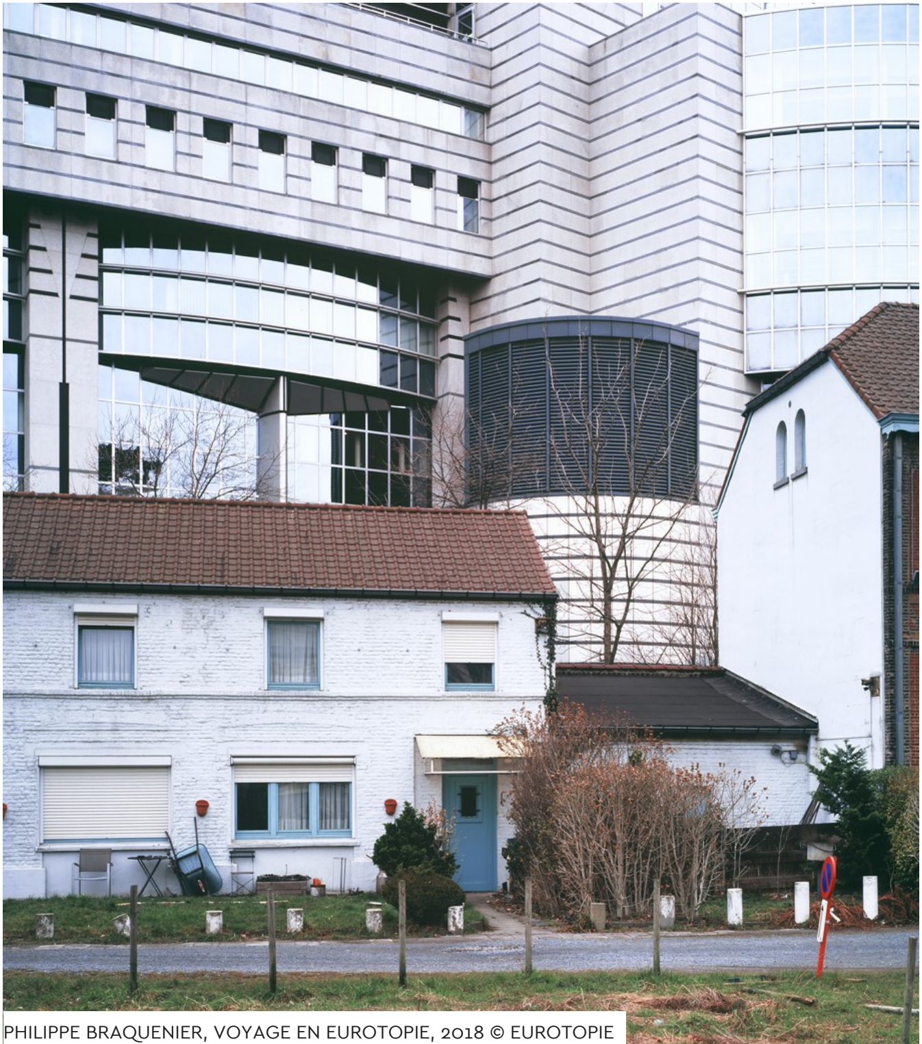
PHILIPPE BRAQUENIER, VOYAGE EN EUROTOPIE, 2018 © EUROTOPIE